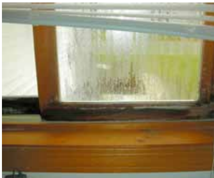
The mold on the window frame was caused by condensation due to high interior relative humidity in conjunction with the occupants keeping the blinds closed during cold weather.

Most codes now require that windows have a temporary label that rates the energy performance of the window. The most common is the NFRC label. The