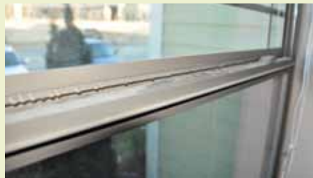
Condensation on non thermally broken aluminum frame

The web site for the American Architectural Manufacturers Association (AAMA) has a condensation resistance factor tool that